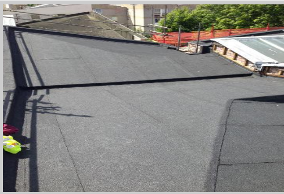
Photo 2 Completed roof section.